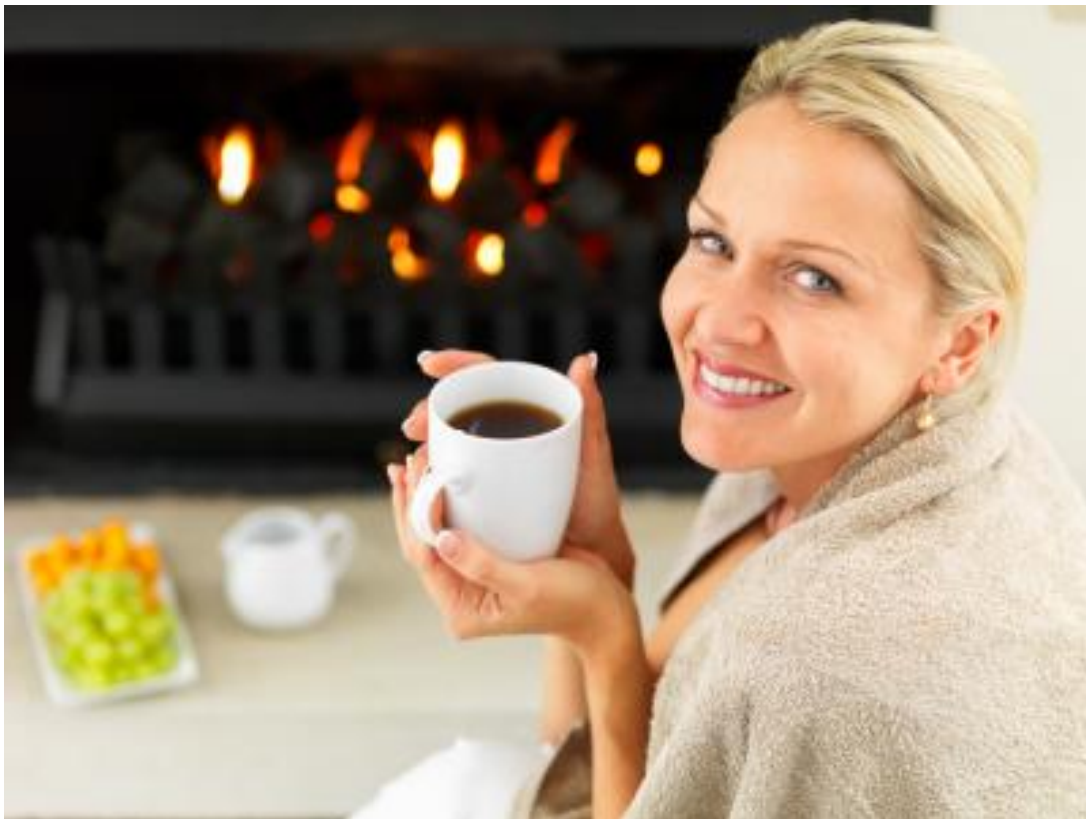
Let your eyes do the talking while HE does the approaching.

Pretty easy, eh? Then what are you waiting for? Get on out there and work some eye contact! You've got nothing to lose, and only everything to gain.