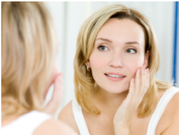
A woman is attractive when she looks like she takes care of herself.

So remember: Who you are on the inside counts for a lot when it comes to finding YOUR Dream Man. But you're making it harder on yourself to find him if your appearance doesn't encourage guys to approach and get to know you. So, make an effort! Work on the pretty within... and the pretty without. Both are important, and both reflect the real you.